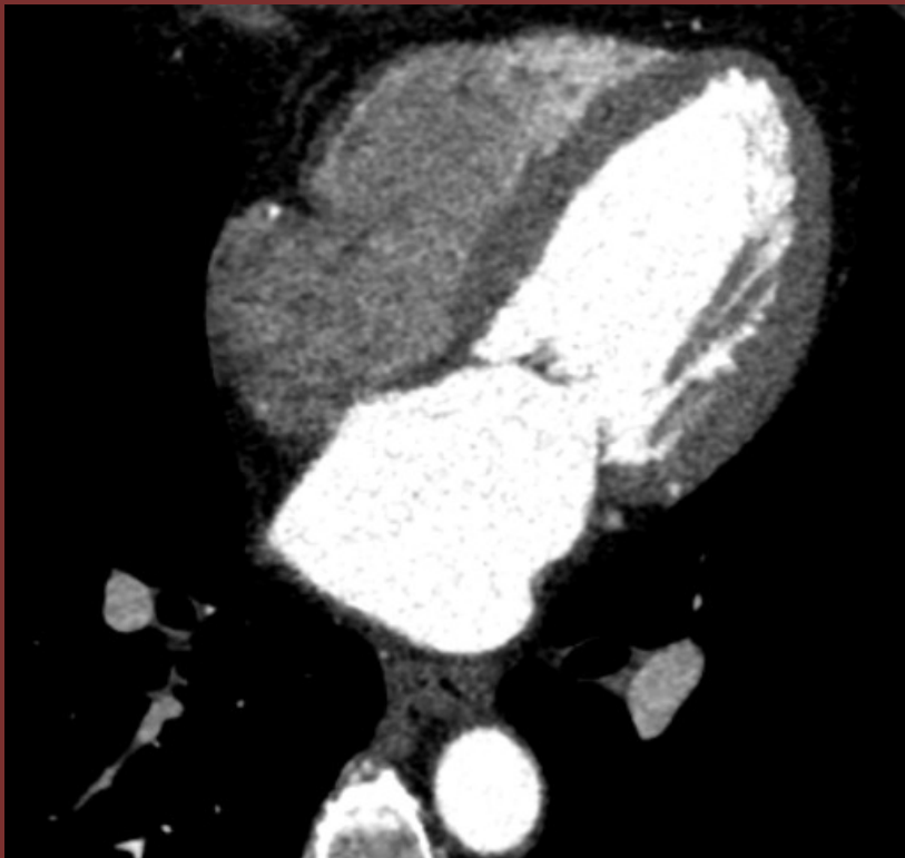
Axial four chamber reformat