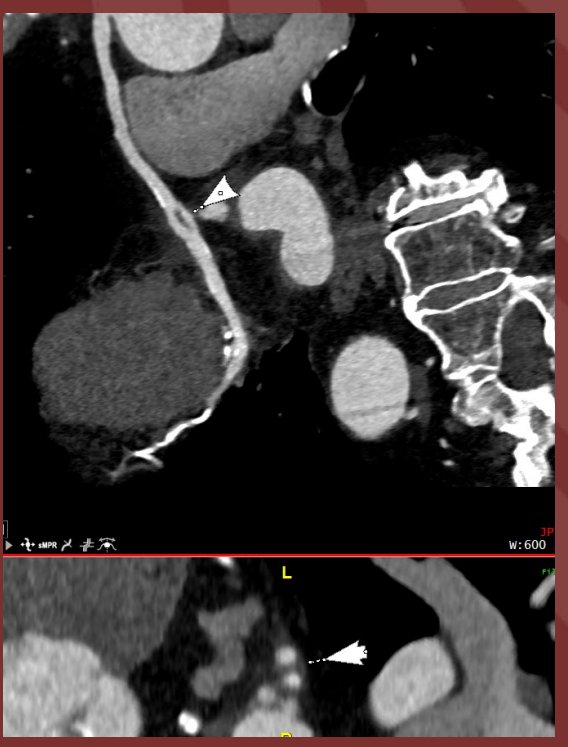
Figure(s): 3D VRT image showing aorta to OM bypass graft. Curved MPR with true axial images demonstrates focal dissection of mid segment graft.